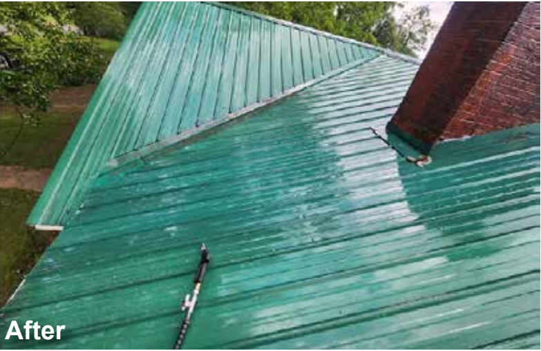
This contractor from Walnut Grove, Alabama used 2 applications of OneRestore to remove the heavy rust stains from this metal roof. With no scrubbing, the stains melted away.