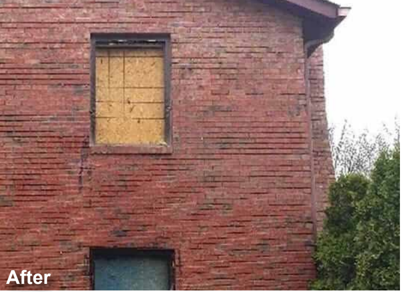
Hot Stain Remover is a concentrated all-purpose style cleaner. In this example it removed the smoke residue left behind from a fire. It can also be used for interior application such as fireplaces or chimneys.