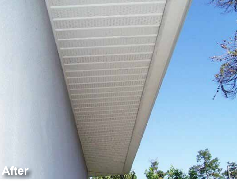
This soffit was covered with black stains. A double application of HD Britenol was used at 30:1 dilution along with a low pressure rinse to remove the stains.