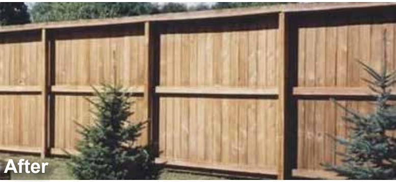
HD Britenol removed the black environmental stains from this wooden fence.