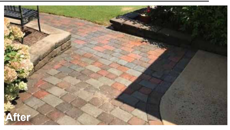
Since scrubbing and high pressure can change the color of the pavers, HD Britenol was used to remove the rust stains without shade shifting the colors. This was achieved with a diluted application at low pressure, allowed to dwell, and followed by a low pressure rinse before drying.