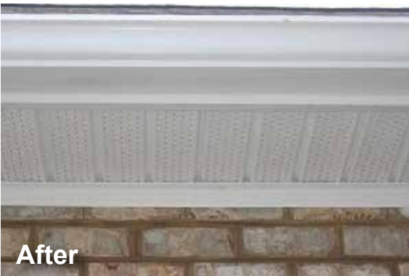
In one fell swoop, Cleansol BC took care of the black stains on the gutters, fascia, and soffit on this home.