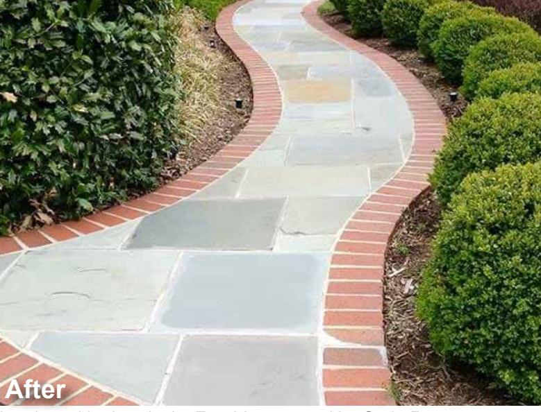
Due to the sensitive nature of bluestone, care must be taken when cleaning with chemicals. For this reason, Hot Stain Remover was used to remove the heavy food grease from this walkway.