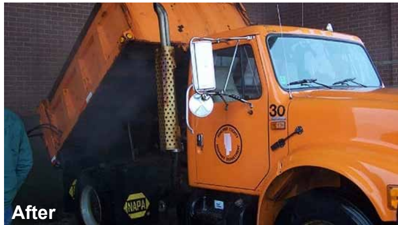
ConSalt removed the grease and road grime from this dump truck.