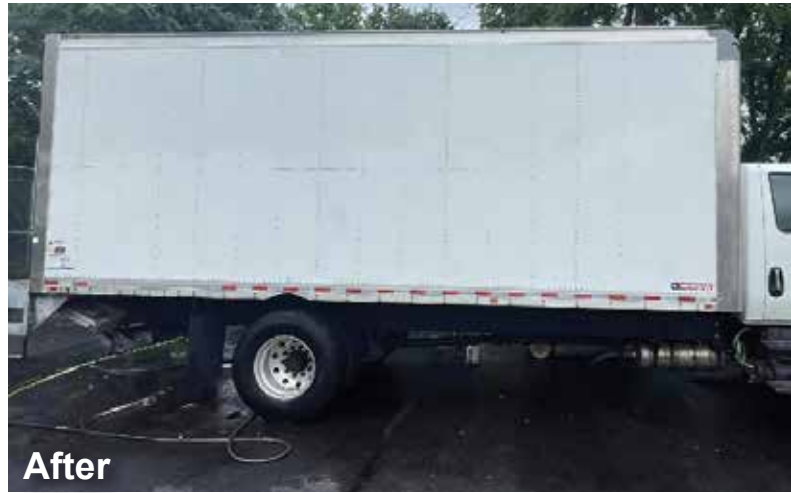
Graffiti on the doors of this delivery truck was removed using Graf-Ex. Graf-Ex is a non-hazardous, low odor liquid stripper that's safe on most substrates.